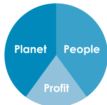
Figure 3: Sustainability 1